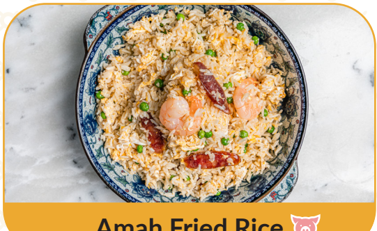
Amah Fried Rice