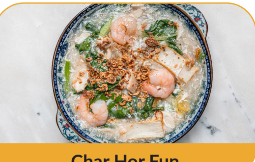
Char Hor Fun