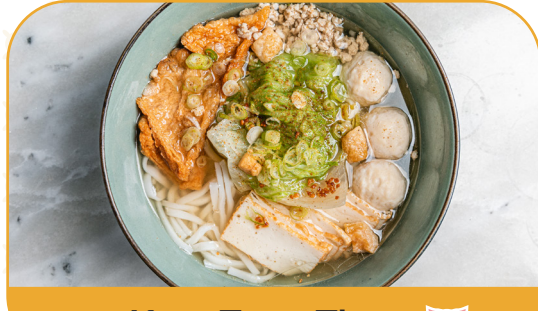
Koay Teow Theng